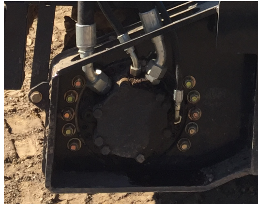
38.26 Cubic inch displacement, direct drive hydraulic motor