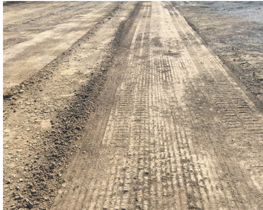
Finish grade vs rough grade