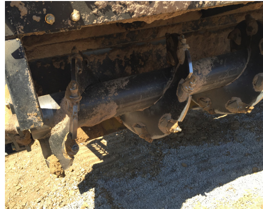
16" diameter, 1/2" steel flighted, Integrated replaceable carbide cutting teeth