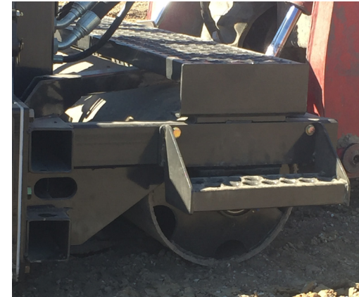
16" diameter rolling drum helps support some weight of the skid steer for a smooth ride and provides a smooth final grade finish