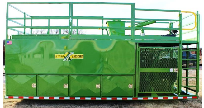
Bowie Imperial 1500 Hydro-Mulcher®