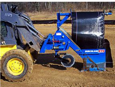
Burchland Silt Fence Installer