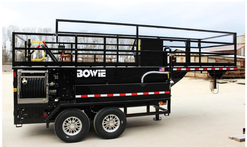
Bowie Victor 1100 Hydro-Mulcher®