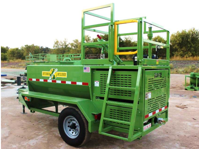
Bowie Lancer 600 Hydro-Mulcher®