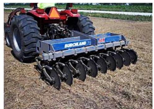
Burchland Straw Crimper