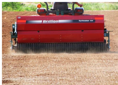
Brillion Seed Drill