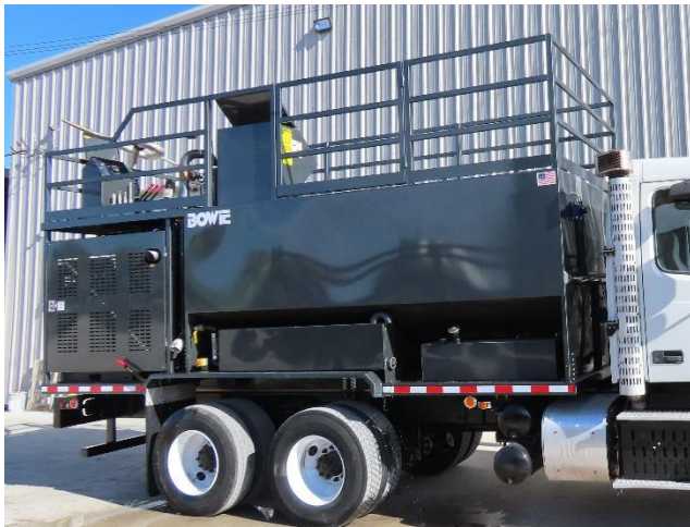
Bowie Imperial 3000 Hydro-Mulcher®

Anyone can sell you equipment, but at ETR, we show you how to make money with your machines. Call us about your equipment needs today.